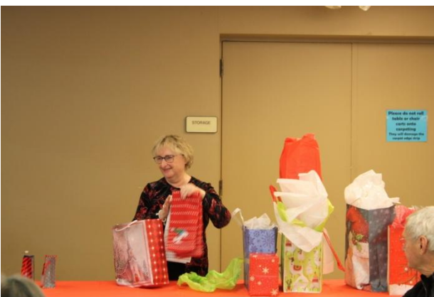
This could be interesting?