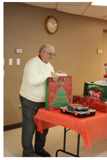
What could this be?