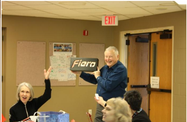
Second owner ... but wait