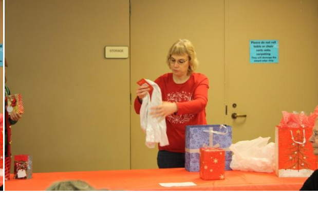
Layne's first gift was stolen ...one of many!