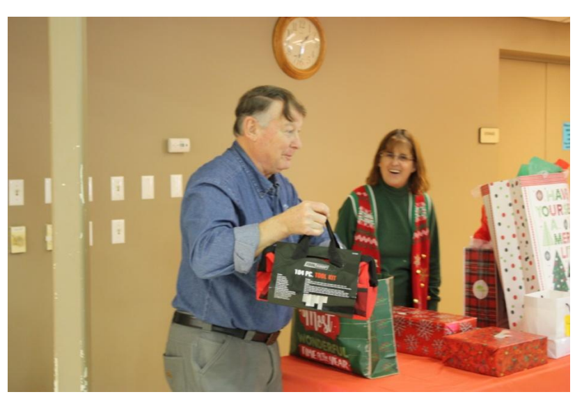
Tools, I always need more tools.