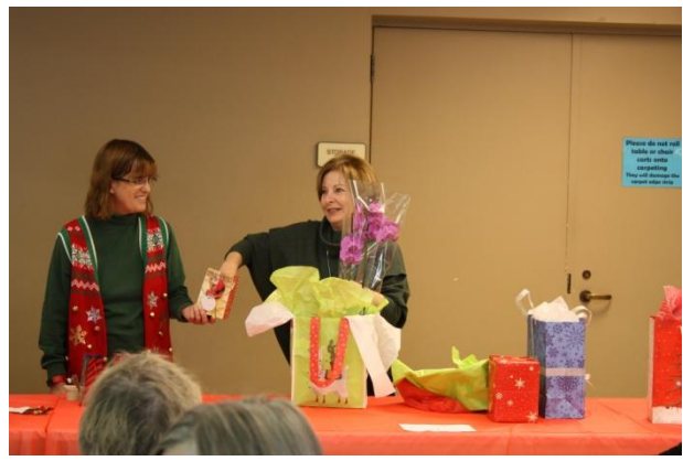
but he has great dance moves!