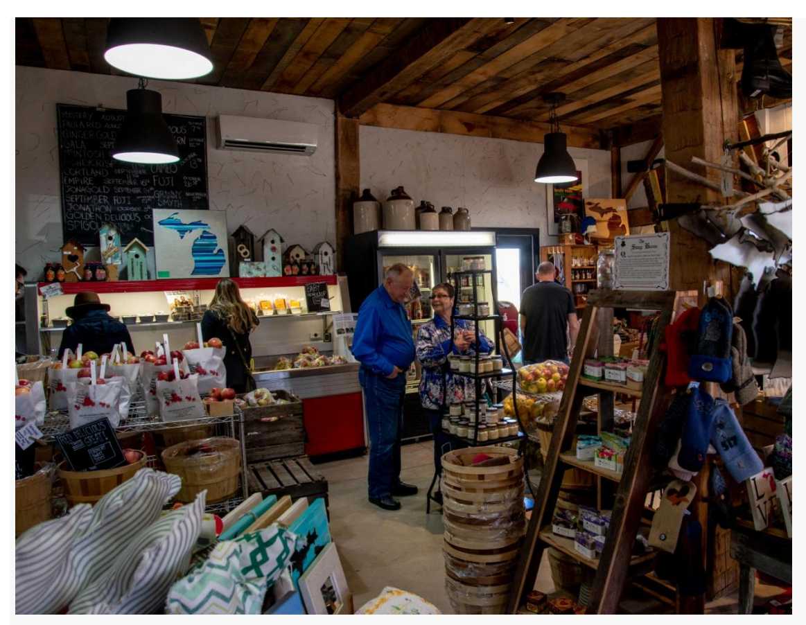
This is where we said goodbye to everyone and headed home.