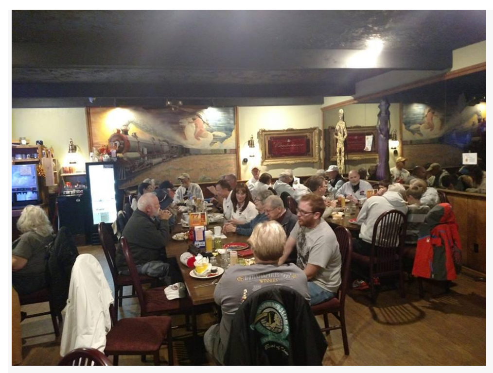
From there the group wondered on back roads to Philips Orchards and the Cider Mill on M127 North of St. Johns.