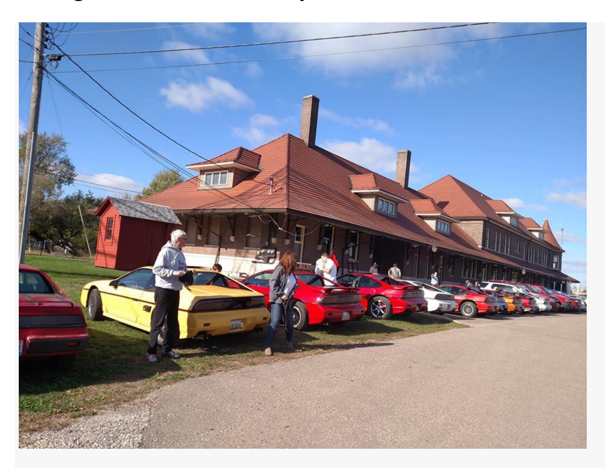
This group does two things very well: (1) Fix Fieros and (2) Eat!