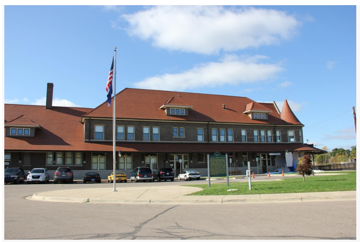
OK, we got there and found somewhere to park: