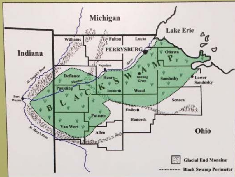
Geological map of the Great Black Swamp