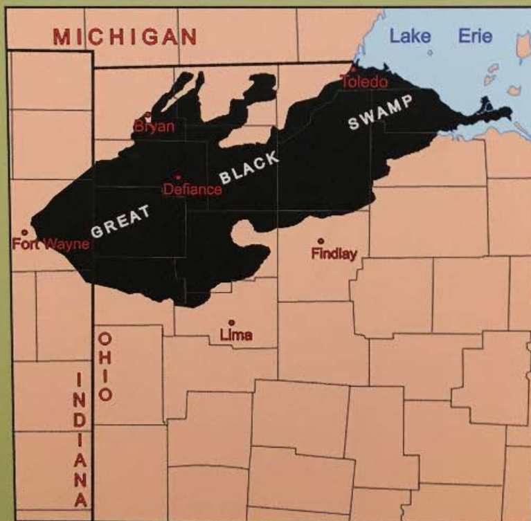
Great Black Swamp Map includes Transitional Zone