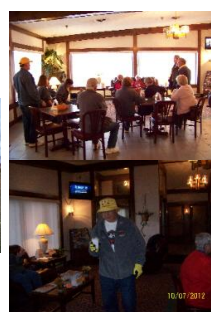
Dinner at Big Buck Brewery